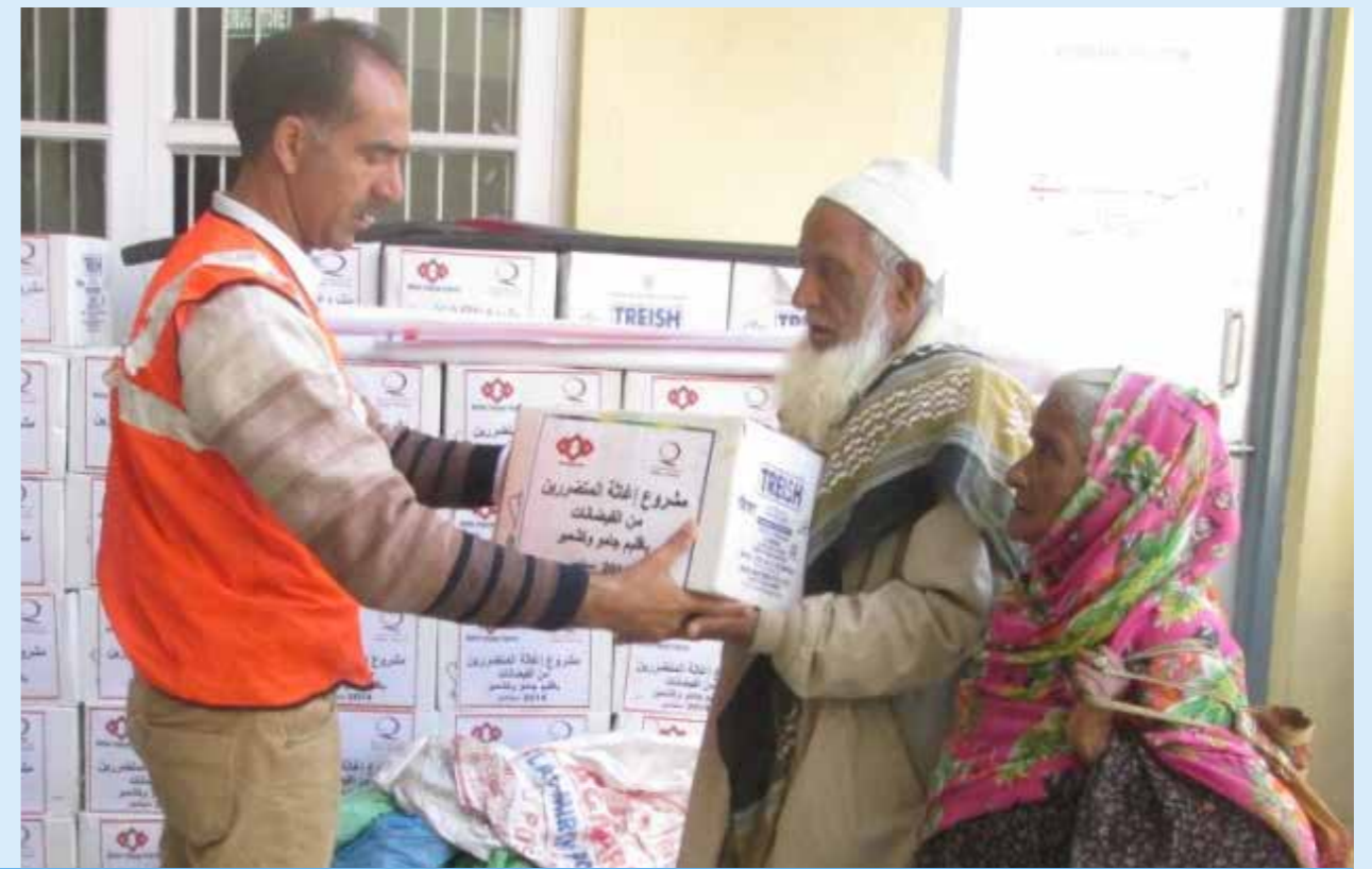
Qatar Charity Office in Pakistan...